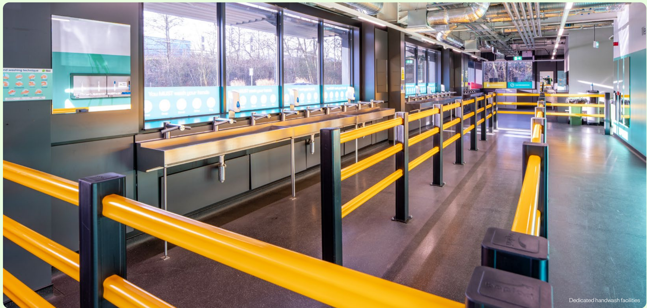
Dedicated handwash facilities