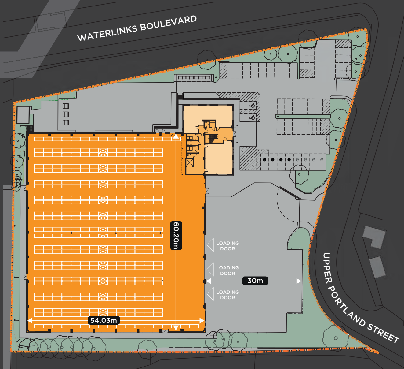
SITE / INDICATIVE RACKING PLAN

A full plan is available to download here: primepoint-birmingham.co.uk/contact