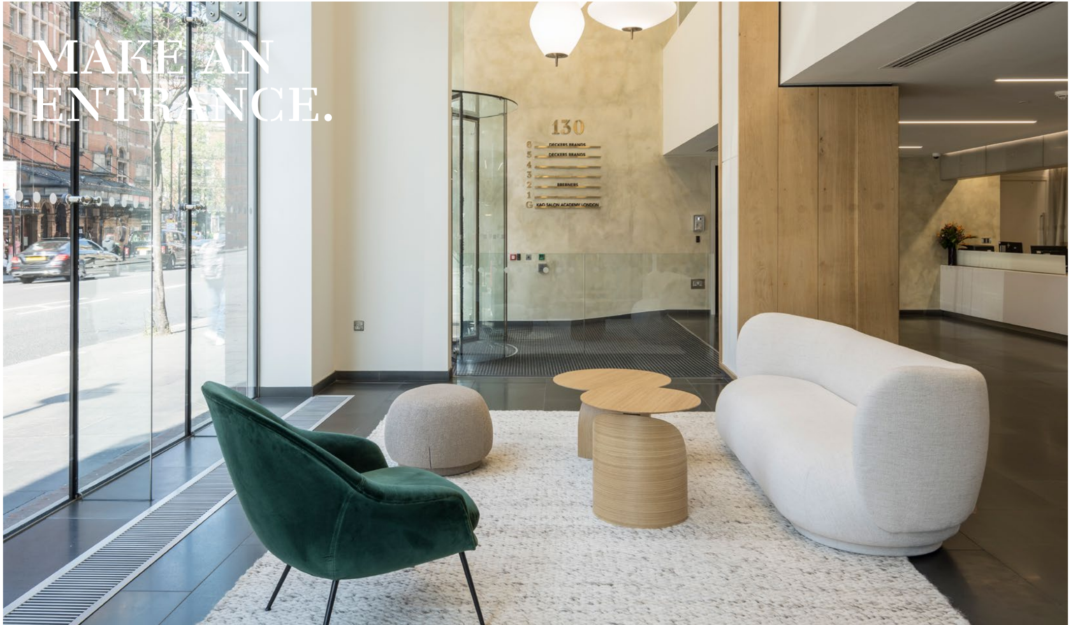
Ground floor reception with soft seating