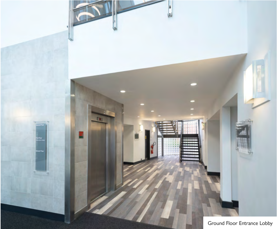
Ground Floor Entrance Lobby