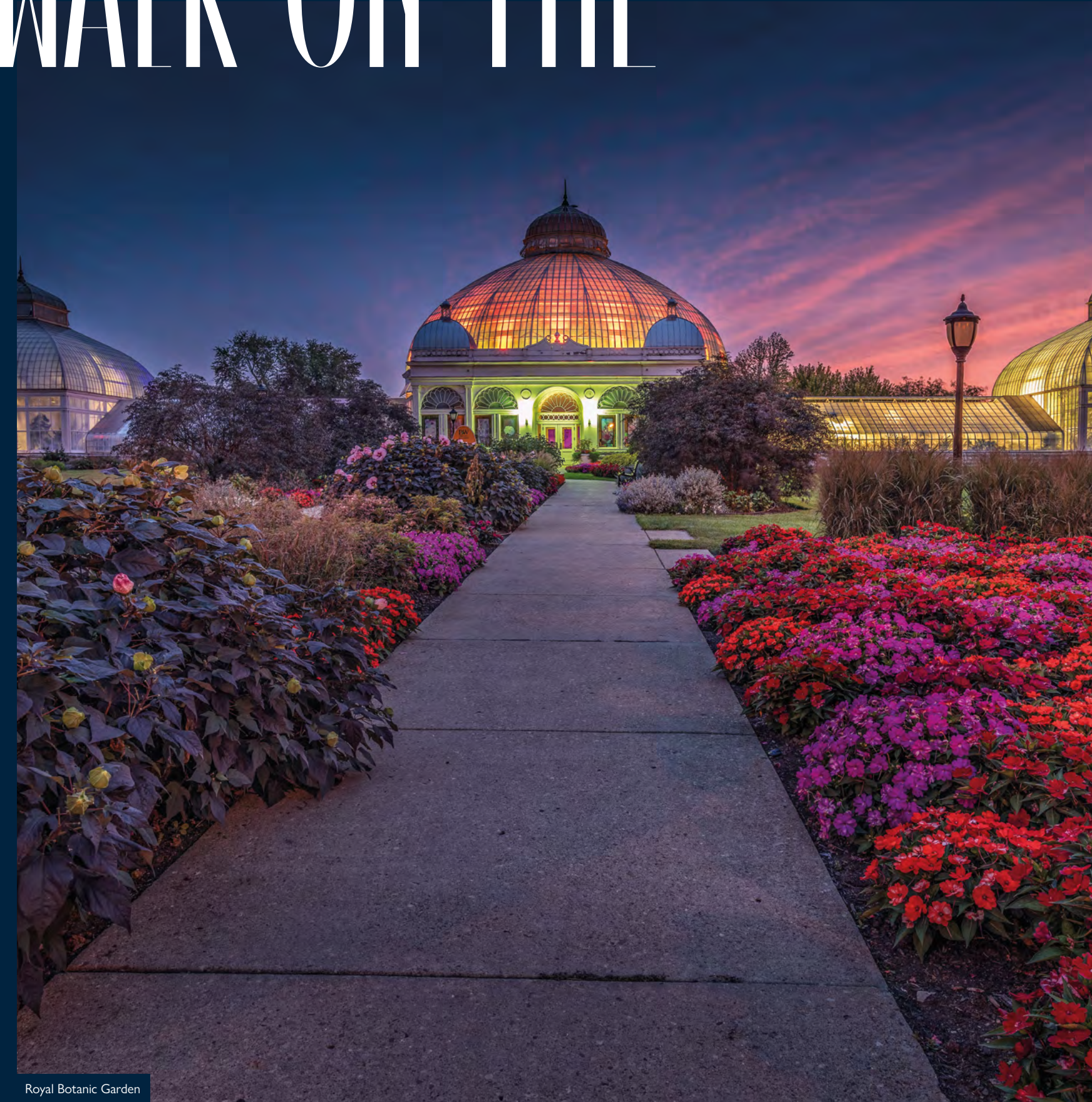
Royal Botanic Garden