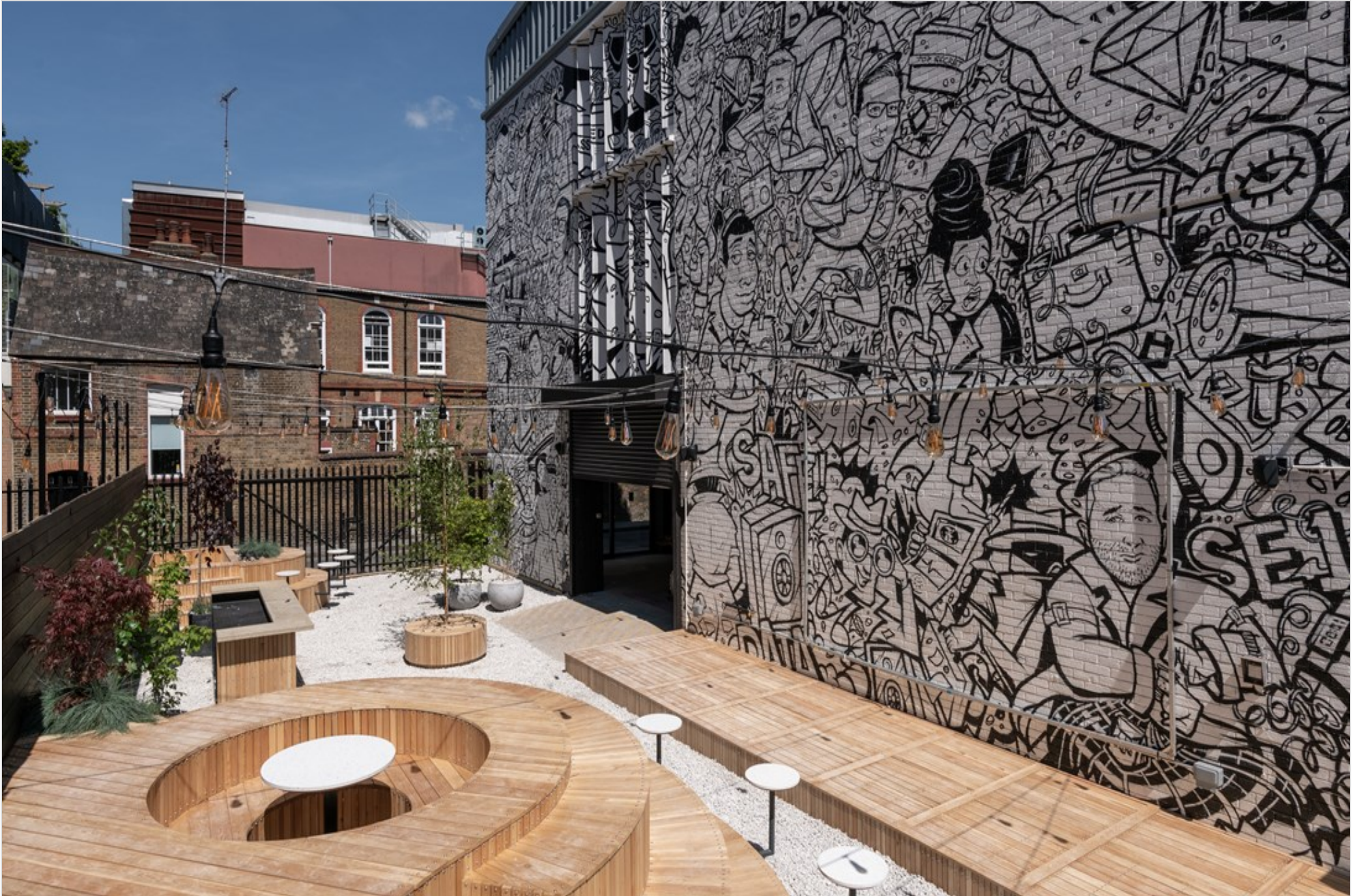
The Binary, 27 Copperfield Street, London, SE1 0EN