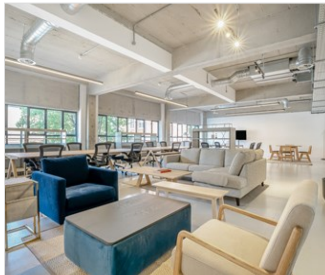
The Binary, 27 Copperfield Street, London, SE1 0EN