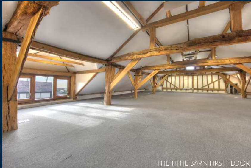
THE TITHE BARN FIRST FLOOR