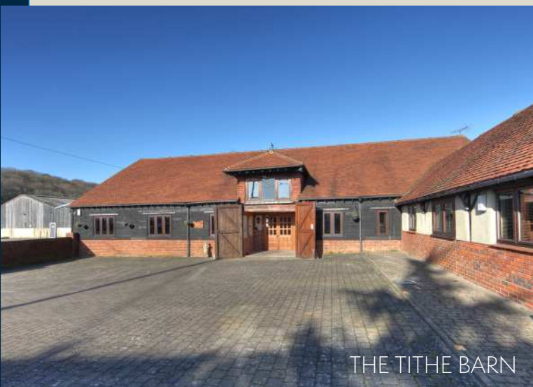
THE TITHE BARN

are former farm buildings which have been sympathetically converted into high quality office space.