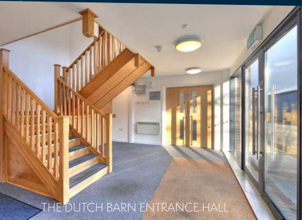
THE DUTCH BARN ENTRANCE HALL