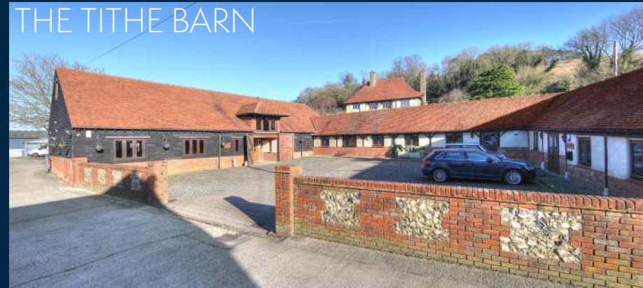
THE TITHE BARN