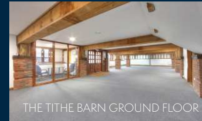
THE TITHE BARN GROUND FLOOR