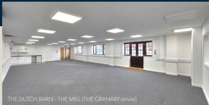
THE DUTCH BARN - THE MILL (THE GRANARY similar)