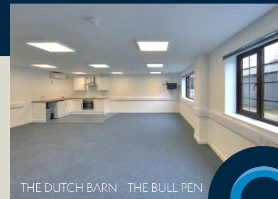
THE DUTCH BARN - THE BULL PEN