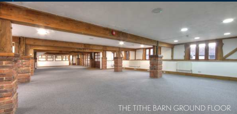
THE TITHE BARN GROUND FLOOR